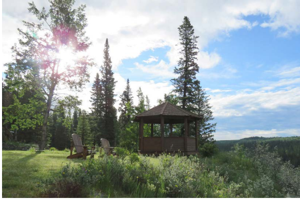
(King's Fold's Gazebo in the Morning)

Location: about a one hour drive from Calgary, Alberta, 35 kilometers northwest of Cochrane.